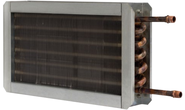
Type Z shown