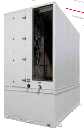
Steel panel construction